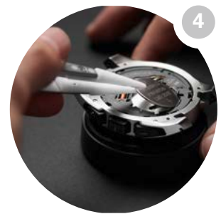
Movement casing and replacement of the battery or accumulator