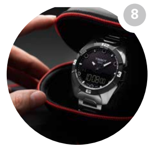
Return of your Tissot