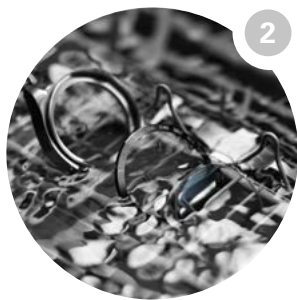
Cleaning of the case and bracelet