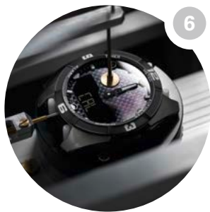
Calibration and inspection of functions