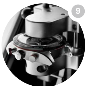
Inspection of the water resistance