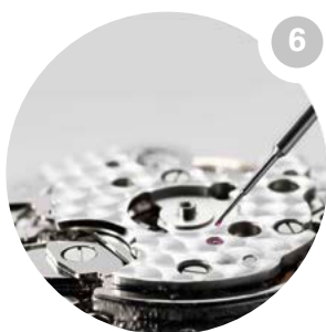
Reassembly of the movement and oiling