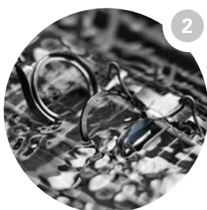
Cleaning of the case and bracelet