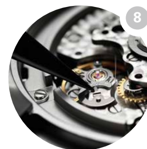
Adjustment of the rate