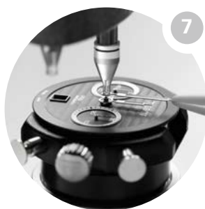
Dial and hands fitting