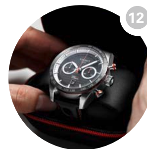
Return of your Tissot