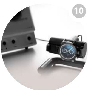
Inspection of the rate and the functions