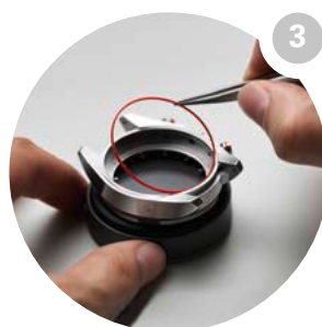
Restoration of the water resistance