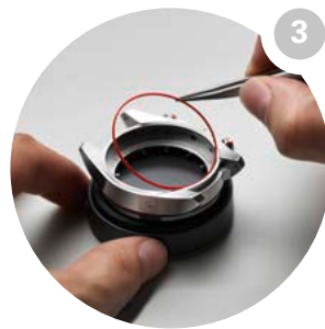
Restoration of the water resistance